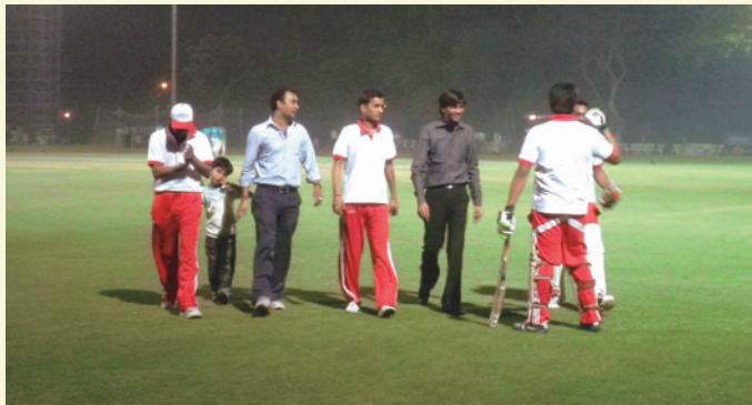
The participating team at the event